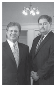
ANDRES & BERGER Award-Winning Certified Civil Trial Attorneys