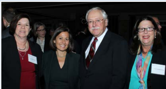
Judge Burns, Judge Wettre, Judge Simandle, Judge Donio